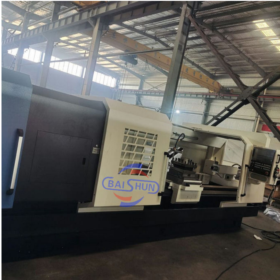
Packing and delivery: