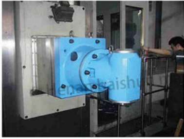
Right Angle Milling Head