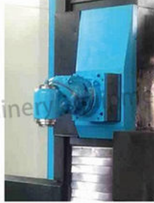
Universal Milling Head