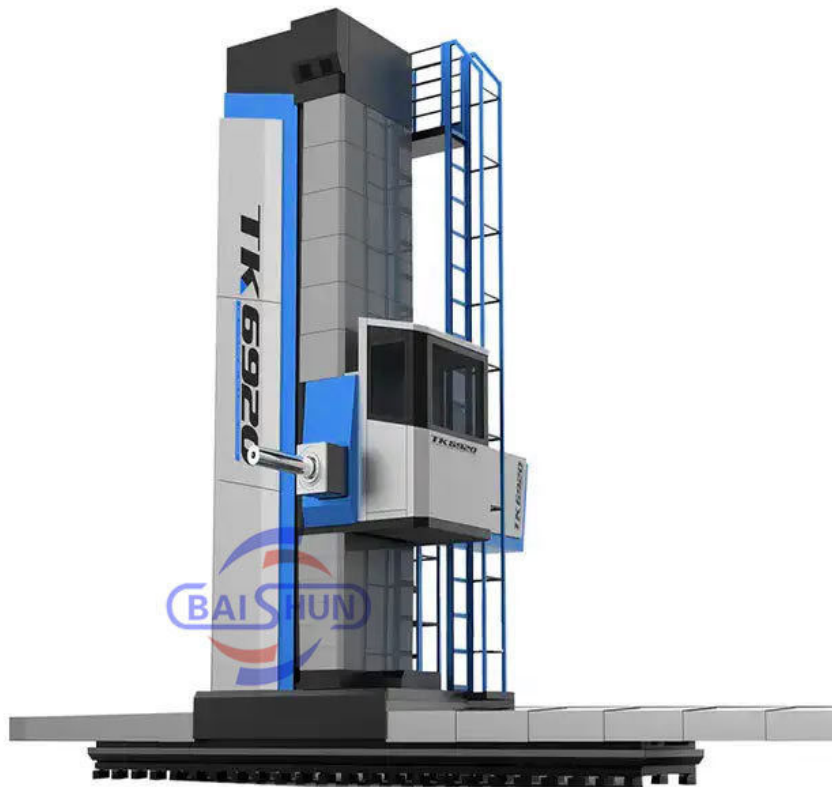
TK69 CNC Floor type boring and milling lathe machine: