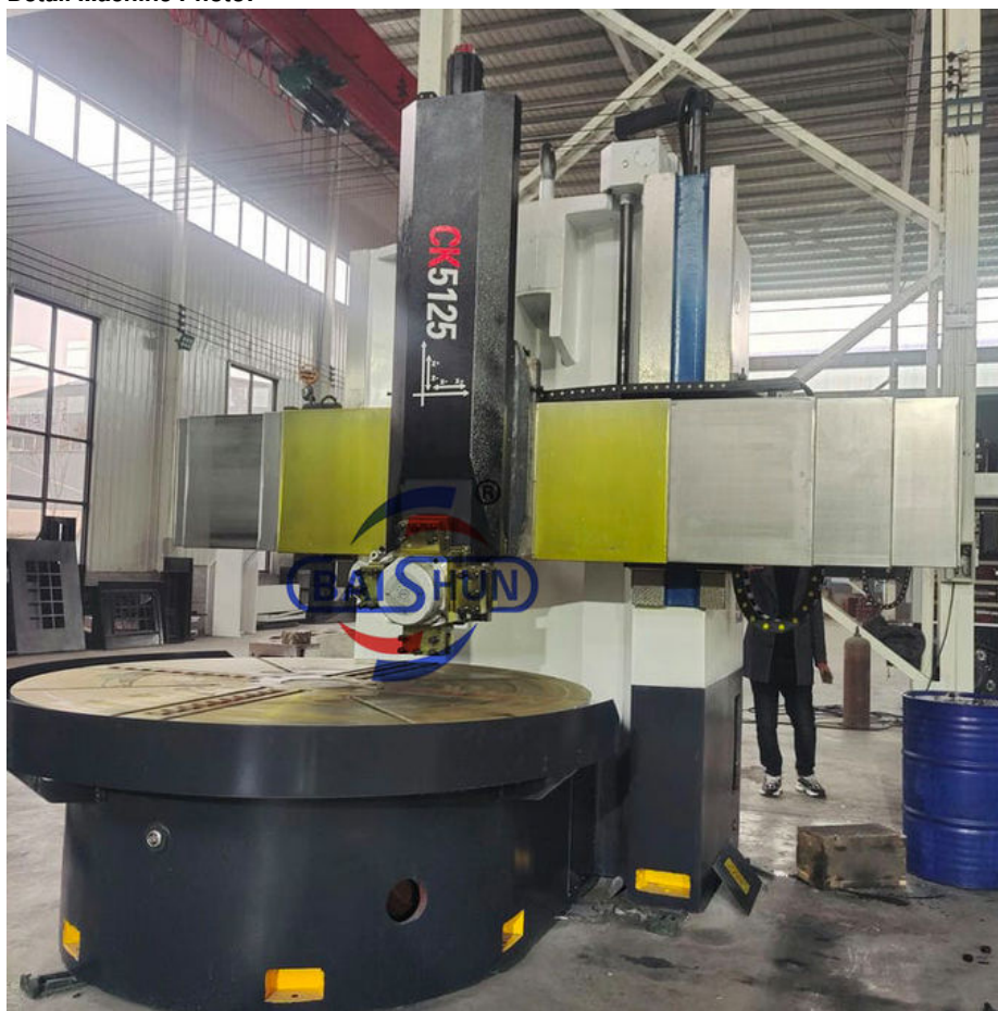
Detail Machine Photo: