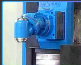
UNIVERSAL MILLING HEAD