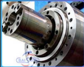
TK65 SERIES BORING MILLS WITHOUT RAM