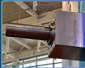
TK68 SERIES BORING MILLS WITH RAM