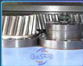
DOUBLE GEAR GAP ELIMINATING-DEVICE