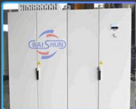
INTEGRATED ELECTRIC CABINET